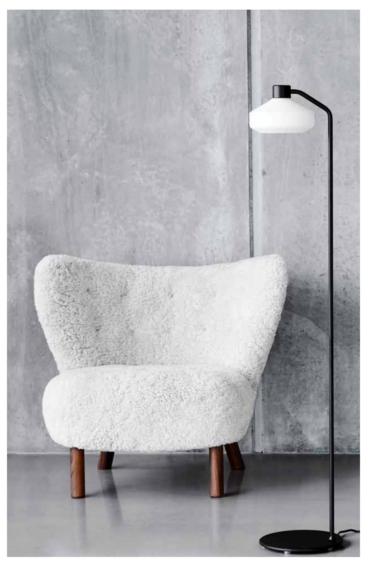
\textbf{MAYOR} \hspace{0.1cm} | \hspace{0.1cm} \text{FLOOR} \hspace{0.1cm} \text{LAMP.} \hspace{0.1cm} \text{HEIGHT} \hspace{0.1cm} 127 \hspace{0.1cm} \text{CM.} \hspace{0.1cm} \text{MATT} \hspace{0.1cm} \hspace{0.1cm} \text{BLACK} \hspace{0.1cm} \text{METAL.} \hspace{0.1cm} \text{OPAL} \hspace{0.1cm} \text{WHITE} \hspace{0.1cm} \text{GLASS.} \hspace{0.1cm} \text{DESIGN} \hspace{0.1cm} \text{TONI} \hspace{0.1cm} \text{RIE}